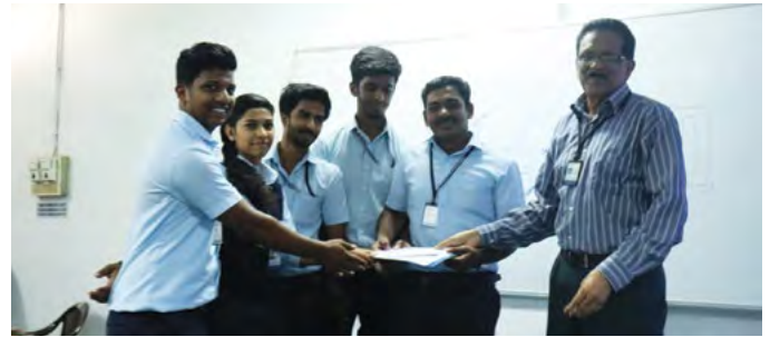
Spark 1.0, a competition for best entrepreneurial idea was conducted.