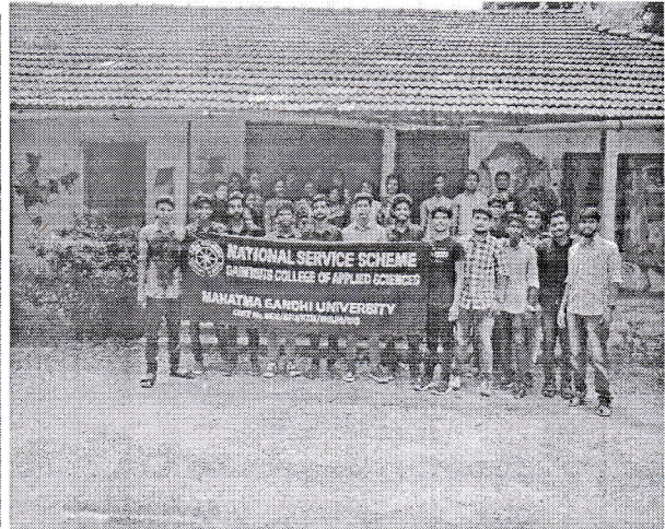
Students in cleaning works