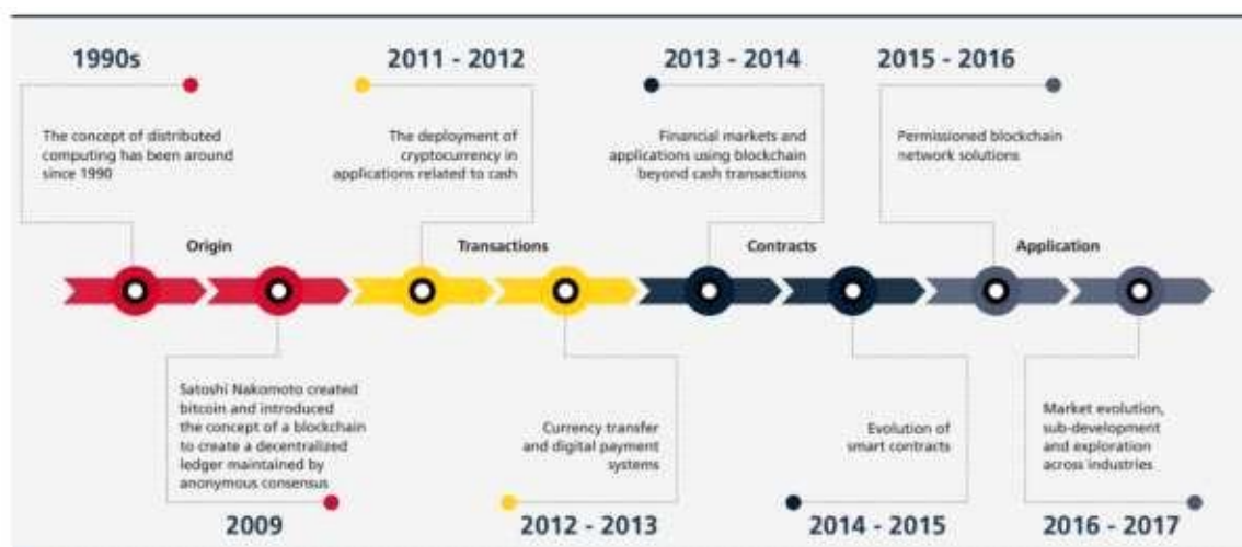
Figure 1. A History of Blockchain Technology