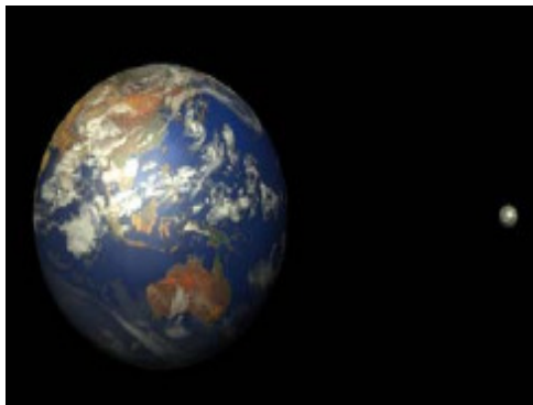
Figure 8-Example of Immersive Virtual Reality System