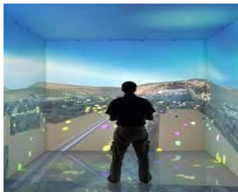
Figure 4- Cave Automatic Virtual Environment Model (CAVE)