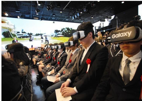
Figure 1-Virtual ceremony held by N High School in Tokyo