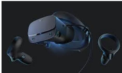
Figure 3- Oculus Rift