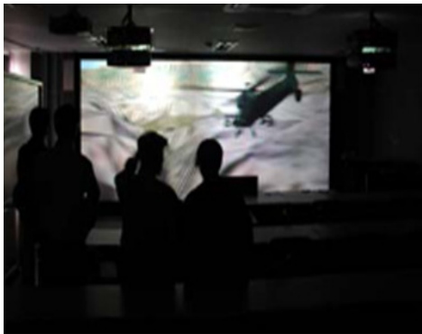
Figure 7- Virtual Reality Learning Environment (VRLE)