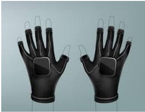
Figure 5- Wired glove