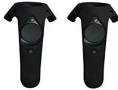
Figure 6- Wands for VR and gaming console