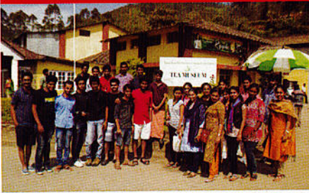
An industrial visit was organised for the 2nd years students to Kannan Devan Tea Museum , Munnar on 26th November 2016.