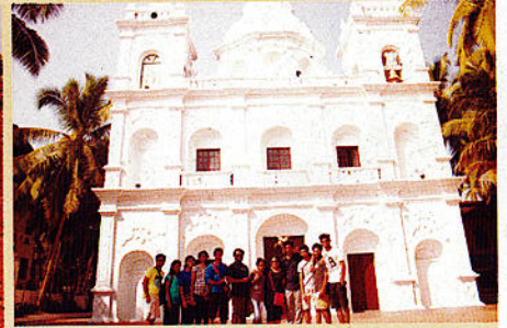
A study tour was organized for the final year students to Goa from 5th-9th of January 2017. Chapora fort, Wagatra beach were among the few attractions visited in Goa .