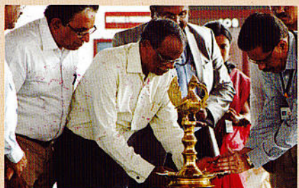
Sri. KT Chacko, former Director General of Foreign Trade, Government of India