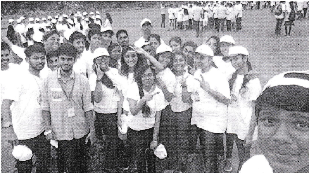
NSS Volunteers at Jaivam Inauguration Camp.

Jaivam inauguration meeting was held on 27th August 2017 at Mahatma Gandhi University sports ground at 9 am by Chief Minister Sri. PinarayiVijayan. It was a pleasant program with many NSS volunteers from different colleges and 38 volunteers from our college participated in the same. Students reached the venue at 8.30 AM in college bus. The program was very informative and students were able to meet other NSS volunteers. The program ended by 12.30 pm and reached college by 1.00 PM.