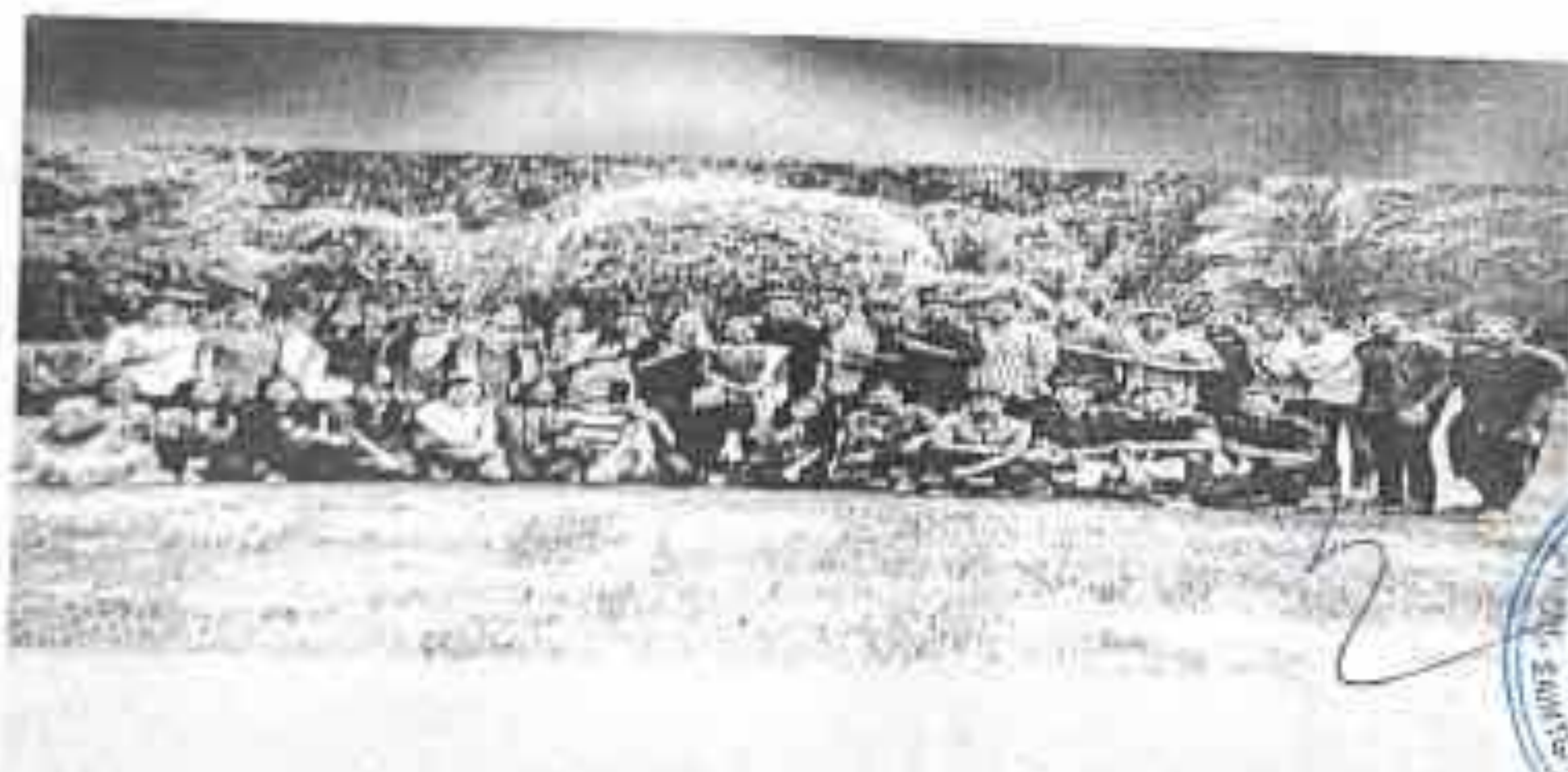
Students at Spirituality Centre, MOC, Manganam.